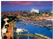
The Port, Palma de Mallorca

Palma, the economic and cultural hub of Majorca, is a delightful base for exploring the island's many gold and white beaches. A former Moorish casbah, or walled city, Palma's Old Town is an appealing maze of narrow streets that are a delight to explore on foot. Hop on the Soller Railway for a 17-mile scenic trip, visit 14th-century Bellver Castle and the museum of contemporary art, and check out the nightlife. (B,L,D)