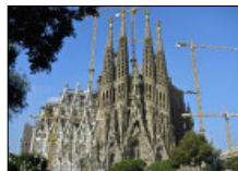
Gaudi's Sagrada Família, Barcelona

For those who have selected the Madrid Post-Cruise Option, refer to description of Madrid – Optional Tour.