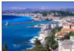
Cote d'Azur, Cannes

Cannes, France is a picturesque city located on the French Riviera. Well known for the Cannes Film Festival that takes place each May, Cannes is also a very popular tourist destination in Europe. Cannes offers visitors great weather, many interesting tourist attractions, museums, and some beautiful Mediterranean beaches. (B,L,D)